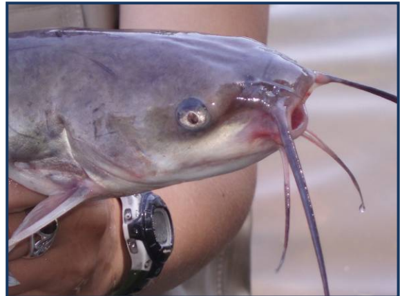
DEP stocked nearly 15,000 channel catfish this week. These fish were released into 13 water bodies throughout the state.

The adult catfish were released into five of the Community Fishing Areas, Lakewood Lake (Waterbury)- 1,350 fish, Bunnells Pond (Bridgeport) – 1,500 fish, Keney Park Pond (Hartford) -500 fish, Lake Wintergreen (Hamden/New Haven) -1,200 fish, and Mohegan Park Pond (Spaulding Pond, Norwich) -750 fish. The yearling catfish were stocked into Black Pond (Middlefield) -1,750 fish, Maltby Lakes 2 & 3 (Orange/West Haven) -730 fish, Lower Bolton Lake (Bolton) -3,000 fish, Pattaconk Lake (Chester) -840 fish, Quonnipaug Lake (Guilford) -470 fish, Silver Lake (Meriden) -1,800 fish and Lake Wintergreen – 750 fish.